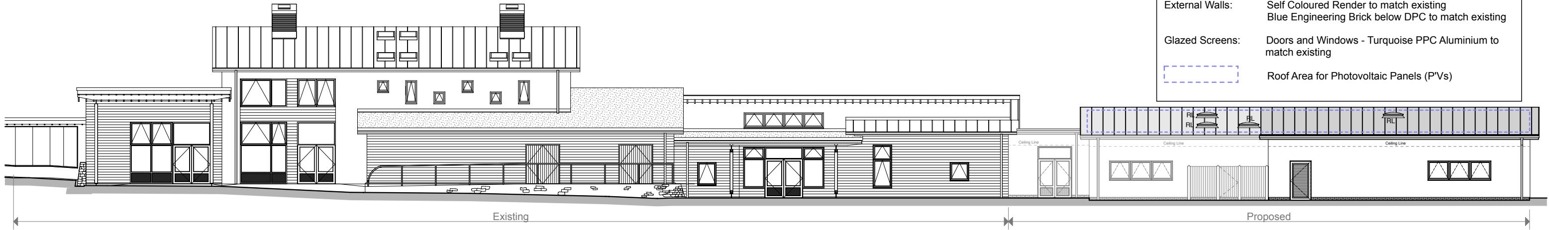
Proposed East Elevation (C)